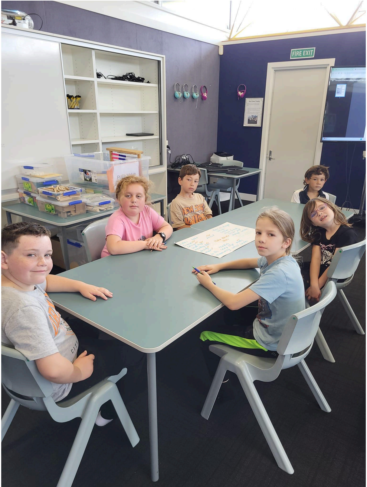
Haka and waiata composer team